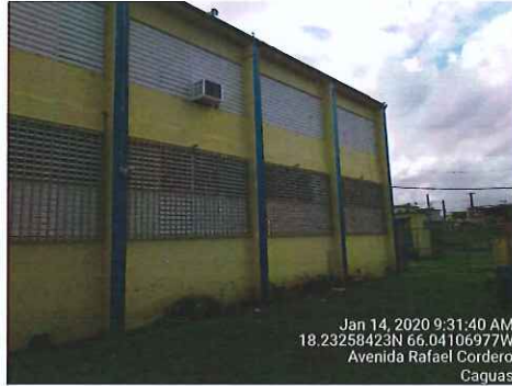
Figura 1:Edificio escolar con columna corta.