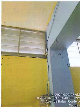
Figura 2 : Salones a cerrar por columna corta